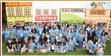
Arizona Camp Agape

Kids 'n' Cancer program provides support for children afflicted with cancer and other life-threatening diseases. Camp Agape offers a life-changing, all-expense paid experience for children and their families. It provides opportunities for enjoyment, learning and building self-esteem and confidence in a safe setting. The kindness and caring that surrounds them offers an ideal environment for therapy and healing. Since our first camp in Dunlap, California in 1989, Camp Agape has expanded to camps in Portland, OR, San Diego, CA and Mayer, AZ. We opened the Arizona camp in July of 2008. June 2024 will mark our 17th year serving Arizona families.