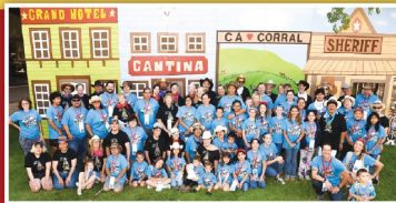
Arizona Camp Agape

Kids 'n' Cancer program provides support for children afflicted with cancer and other life-threatening diseases. Camp Agape offers a life-changing, all-expense paid experience for children and their families. It provides opportunities for enjoyment, learning and building self-esteem and confidence in a safe setting. The kindness and caring that surrounds them offers an ideal environment for therapy and healing. Since our first camp in Dunlap, California in 1989, Camp Agape has expanded to camps in Portland, OR, San Diego, CA and Mayer, AZ. We opened the Arizona camp in July of 2008. June 2024 will mark our 17th year serving Arizona families.